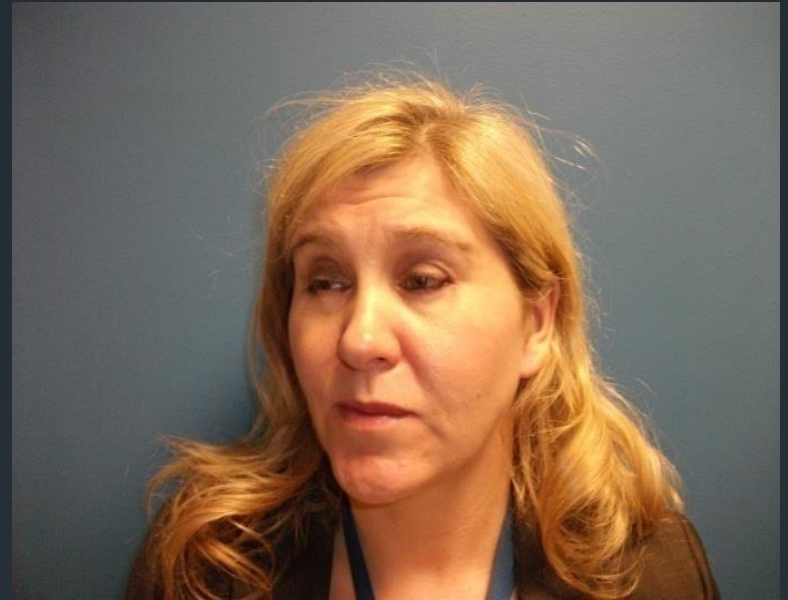
6 Weeks Post Op