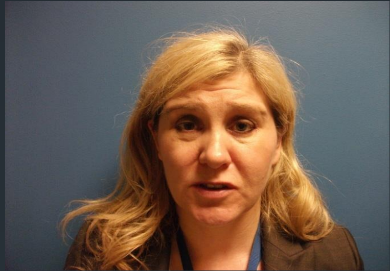
6 Weeks Post Op