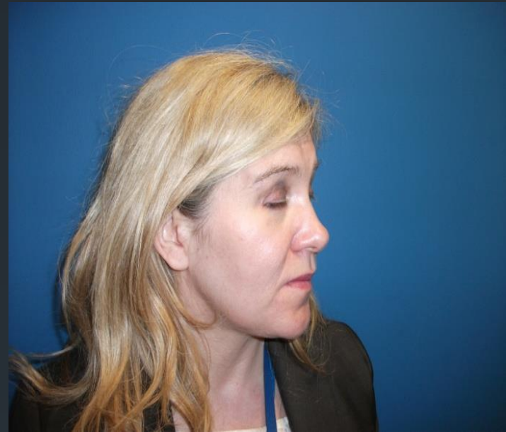
6 Weeks Post Op